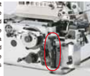
Differential-feed micro-adjustment mechanism

The differential-feed micro-adjustment mechanism, external increasing of the differential feed ratio and the main feed dog height can all be adjustable on the front face of the sewing machine with a screwdriver. The machine is provided as standard with functions which enable easy and best-suited adjustments according to the material to be used.