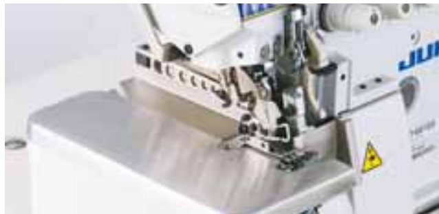
For runstitch / MO-6816S-FF6-30H

The machine is widely applicable to the sewing of light- to heavy-weight materials. Since the machine is provided with a needle thread take-up mechanism and a looper thread take-up lever, it ensures high-quality, well-tensed and soft seams with a beautiful texture which flexibly correspond to the elasticity of the materials even when run at speeds as high as 7,000 sti/min. In addition, the machine has a wider and brighter needle entry and provides improved responsiveness to the materials, thereby helping the operator use the machine more easily. The optimally-balanced design of the machine reduces both operating noise and vibration, contributing to more comfortable sewing work.